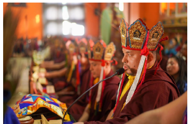
Monks conduct the Vajrayana rituals during the Vajrakilaya Drupchen