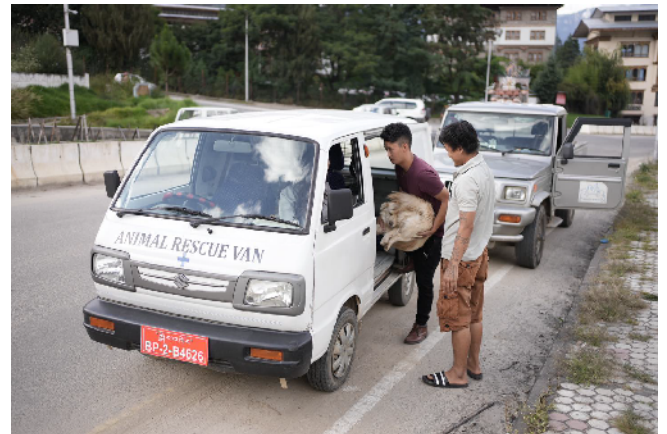
Animal Rescue and treatment program for street animals by Jangsa