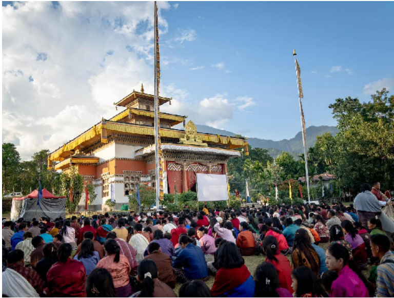
The lay congregation during a Vajrakilaya Retreat in Pema Yoedling monastery

Pema Yoedling Vajrakilaya Monastery is a key center for Vajrayana practice in Gelephu Bhutan, the vision of Lama Pema Longdrol that was established by Lama Kunzang Dorjee Rinpoche dedicated to the powerful deity Vajrakilaya.