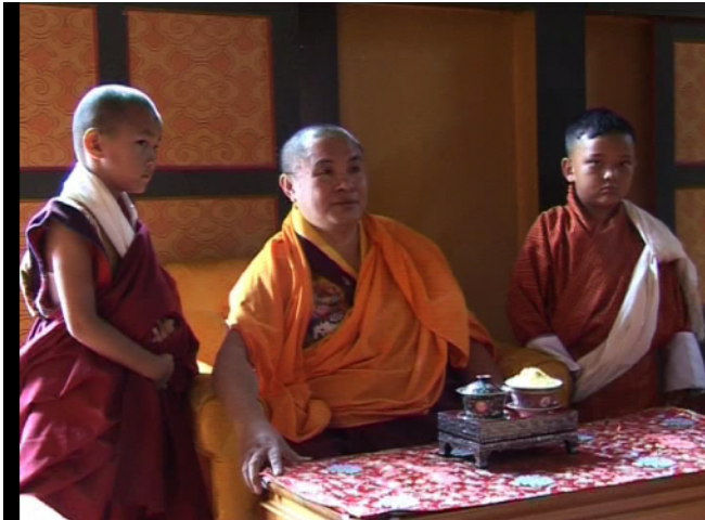
During the enthronement ceremony conducted by H.H Tulku Jigme Choedra - the 70th Je Khenpo of Bhutan

Throughout his life, he remained dedicated to the practice of Dzogchen and the dissemination of the Dudjom Tersar teachings, focusing on both monastic life and the training of future generations of practitioners.