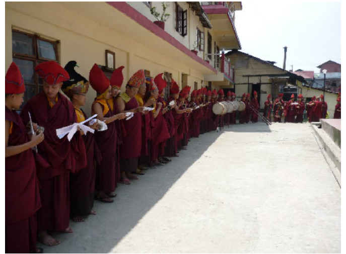
Jangsa Dechen Choling Monastery, among the oldest in the Nyingma tradition, where the first Vajrakilaya Drubchen was presided over by H.H. Kyabje Dudjom Rinpoche, H.H. Dilgo Khyentse Rinpoche, and other great masters.