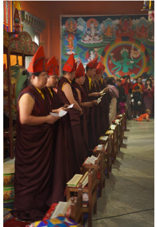
Retreatant monks perform the Vajrakilaya Drupchen

Pema Yoedling Vajrakilaya Monastery is a key center for Vajrayana practice in Gelephu Bhutan, the vision of Lama Pema Longdrol that was established by Lama Kunzang Dorjee Rinpoche dedicated to the powerful deity Vajrakilaya.