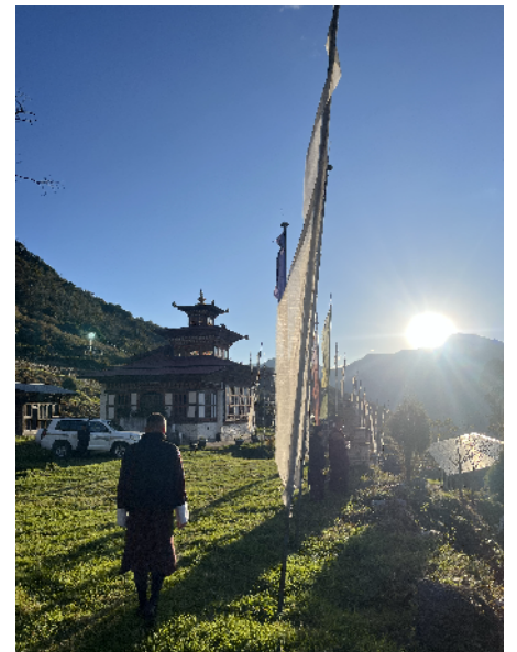
Lhundrup Dechenling Monastery Kurtoe, Eastern part of Bhutan,