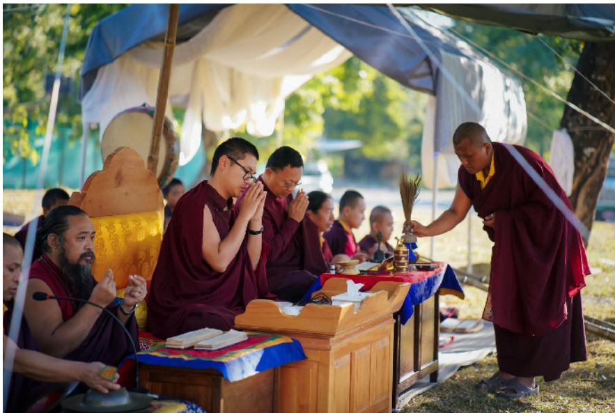
Pema Yoedling Vajrakilaya monastery, Gelephu, Bhutan