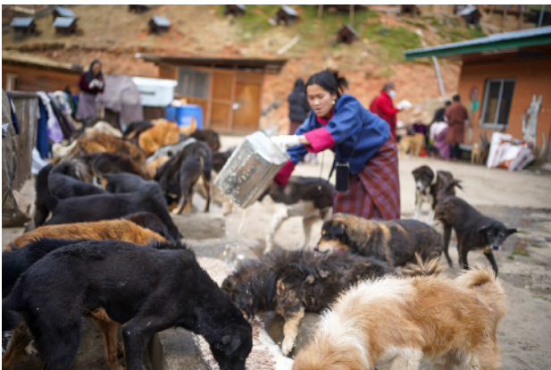
Animal Rescue shelter and ICU located in Thimphu