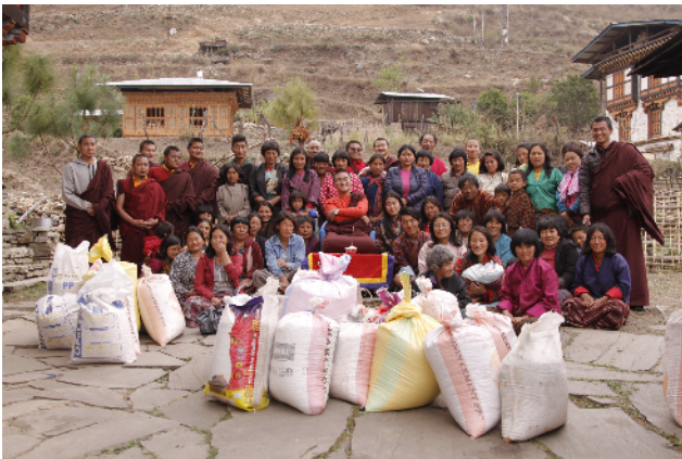
Rinpoche traveling across Bhutan, teaching and inspiring local communities in saving animals lives and preserving Bodhichitta